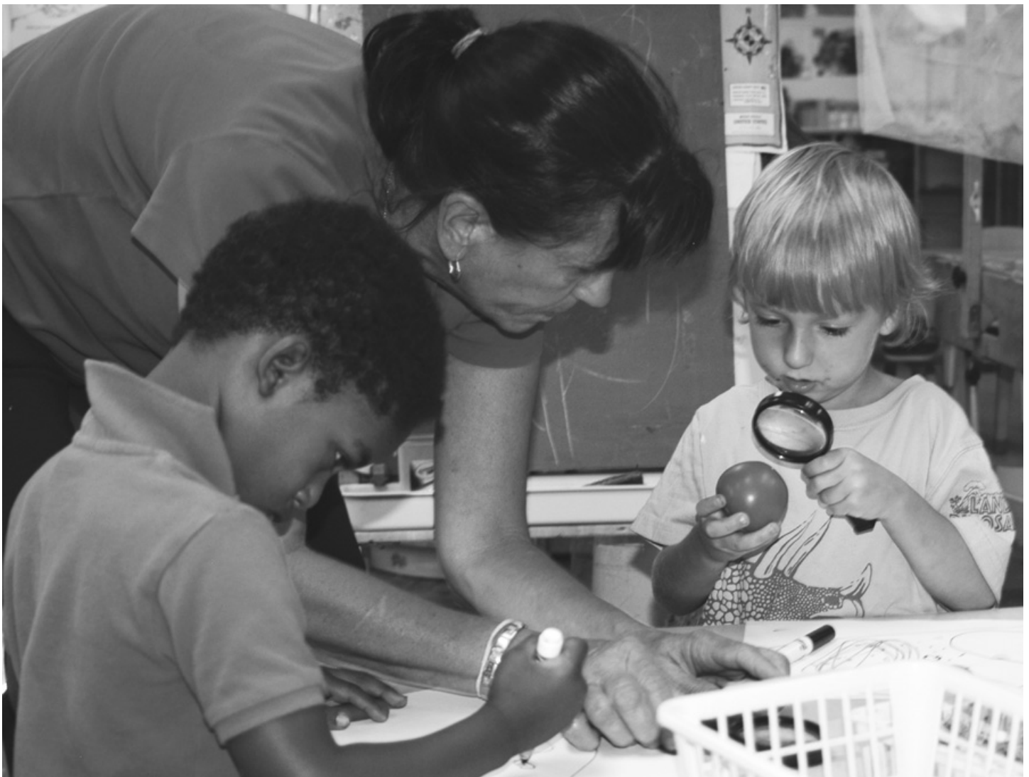
Subjects & Predicates

Peer mediation often occurs naturally in preschool settings. Children typically observe and interact with others in ways that scaffold development. An important aspect of designing curriculum and the learning environment is to make sure that young children have ample opportunities to interact with and learn from one another.