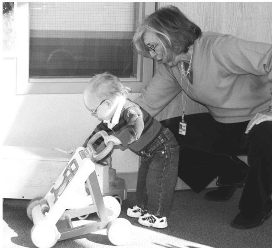
Subjects & Predicates

The ability to generate and sustain children's interest in learning is a