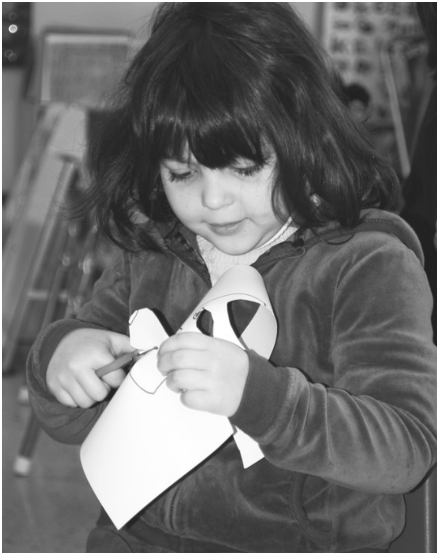
Subjects & Predicates

Effectively individualizing instruction is a cycle that involves knowing individual children, implementing effective instructional strategies, and determining whether or not the choices made resulted in child learning.