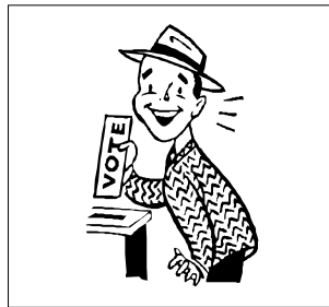
Don't forget to vote!

They differ in generation, perspective and solutions to the problems that the United